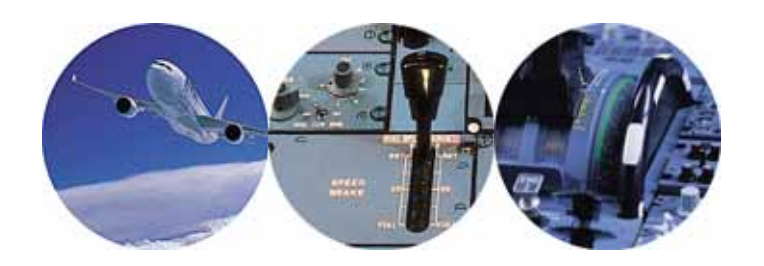
Flight Operations Briefing Notes Approach Techniques Flying Stabilized Approaches